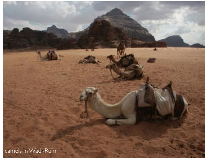
camels in Wadi-Rum

It’s hard to put into words the mystic of this Kingdom. It’s captivating and historic, filled with friendly people and delicious food. My evenings were spent dancing to Jordanian music and feasting on Middle Eastern cuisine. At the end of this journey, I was sad to leave but thankful to have experienced the magic and beauty which lies beneath the Jordan moon.